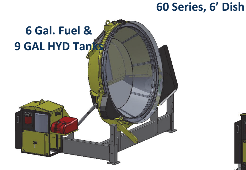
13HP Engine Option