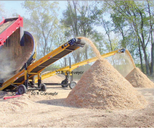
Modular Design Allows for Adding 20', 30' or 40' Conveyors